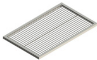
GRE.F2.G10 Rod grid round