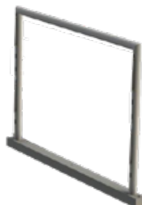
GRE.F2.P70 Support grids