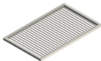
GRE.F2.G20 Square grid