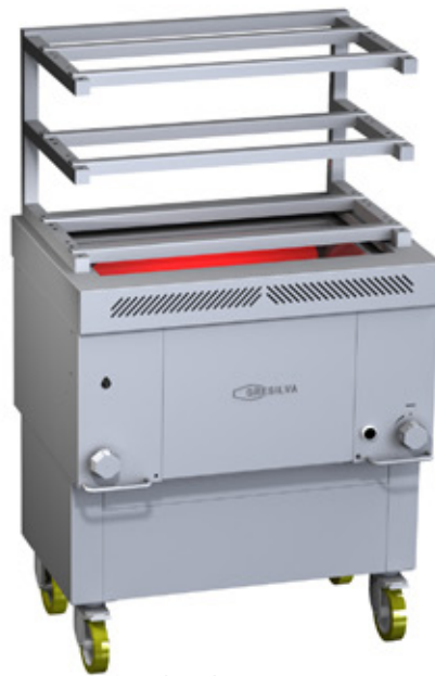
with Robata system